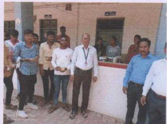
Inauguration of Trade Fair by Hon. Mahendra Appa Lad