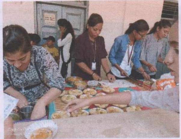
Visit to Stall